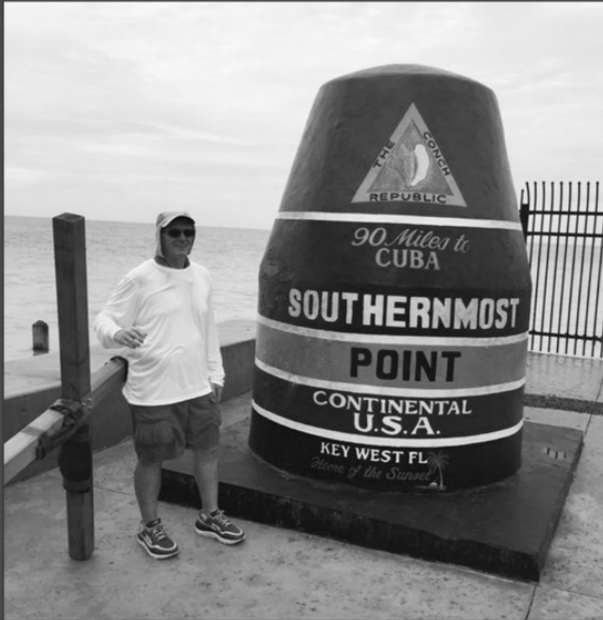
Key West, FL (June 2016)

For a week in June 2016, the author along with his two grandsons and son-in-law carried this 13'x6' cross from Key Largo, FL, to the Southern Most Point of the United States.